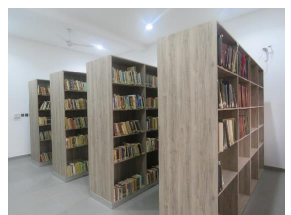
Section of the Library

The library is also in the process of obtaining recommended books for some departments in Ahmadu Bello University. There is a dearth of required reading material in many areas, and we hope to make many of these available for students to read in our library.